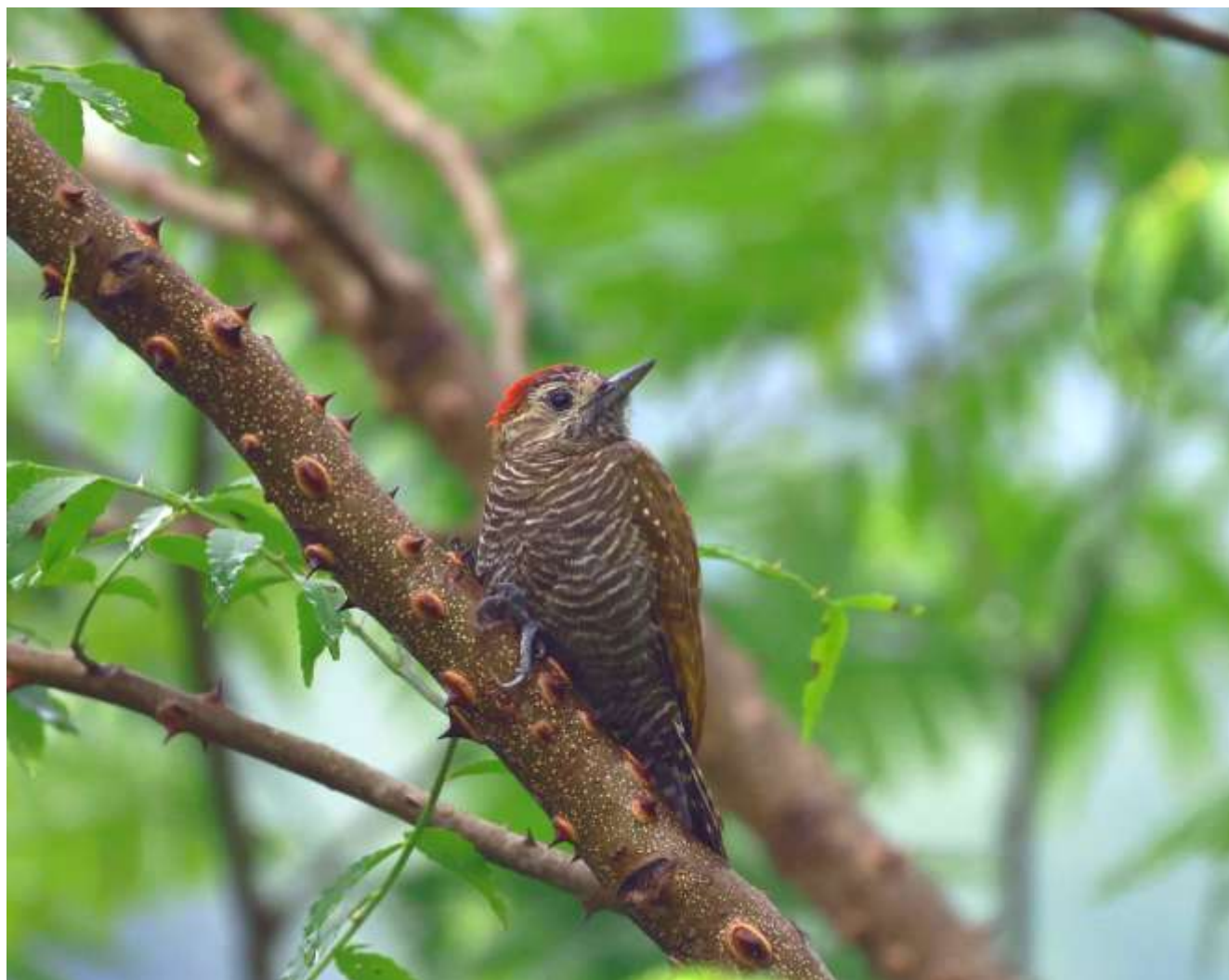
Male Dot-fronted Woodpecker

among them Yungas Guan, Dot-fronted Woodpecker, Tucuman Parrot, Slender-tailed Woodstar, Buff-banded Tyrannulet, Plumbeous Black-Tyrant, Brown-capped Redstart, the endemic Yellow-striped Brushfinch, and Rusty-browed Warbling Finch—though the real star, of course, will be the dipper.