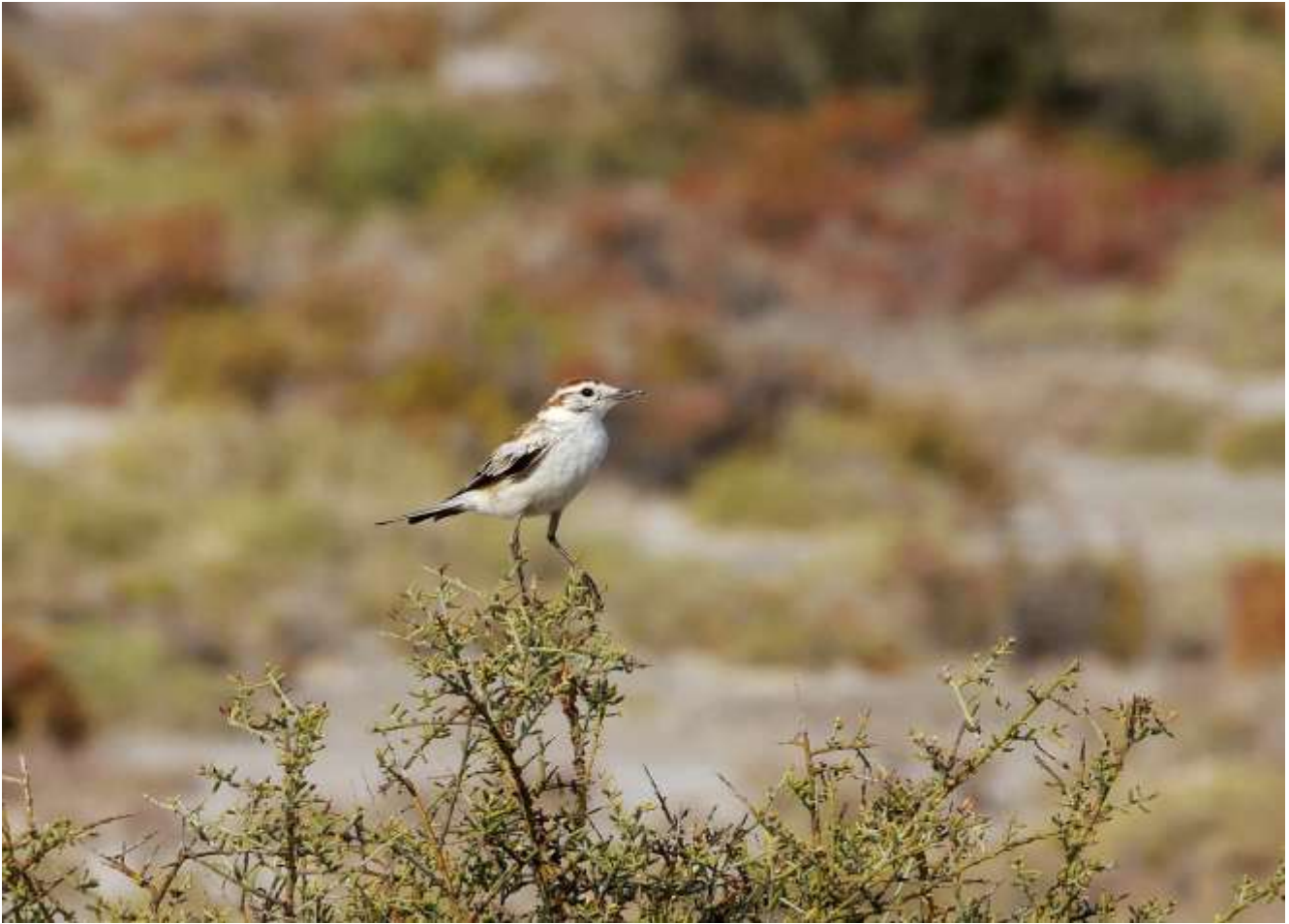
The endemic Salinas Monjita