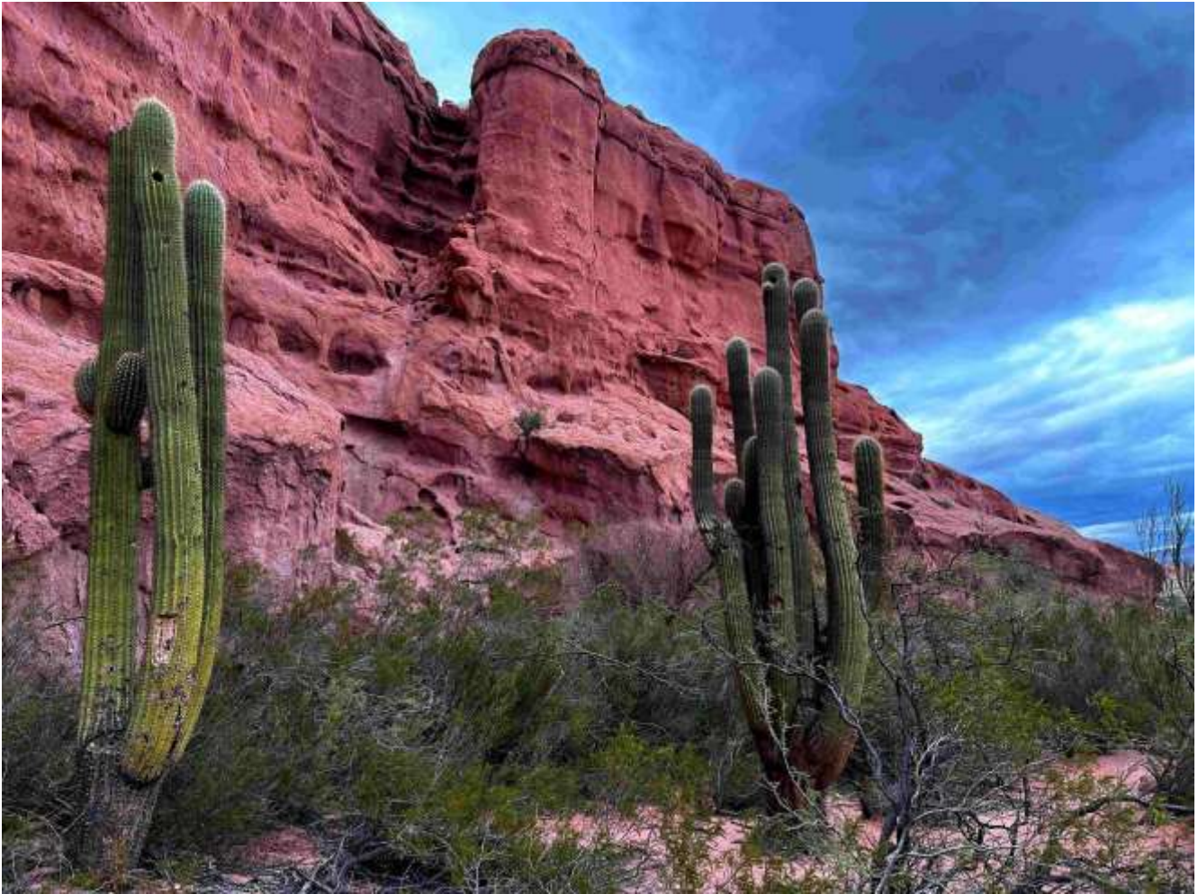
Amazing sandstone formations of Las Conchas

Following a great dinner, we will offer an owling excursion in the hotel grounds our prime target the rare and near-endemic Chaco Owl.