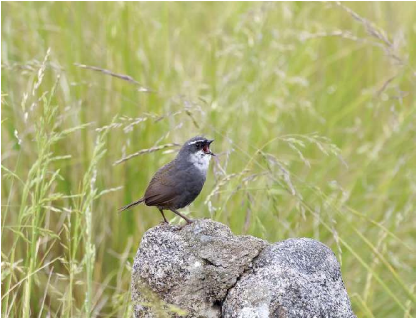
Endemic White-browed Tapaculo

Returning to our hotel after a full day's birding. Following the bird list, we will enjoy a wonderful dinner in an excellent nearby local restaurant.