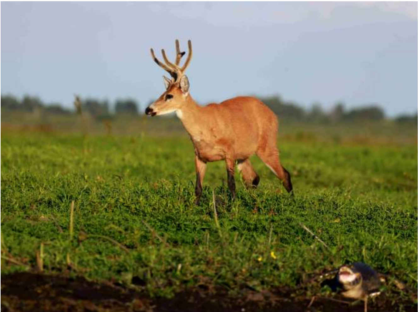
A male Marsh Deer and Jacare Caiman (foreground)

January 6, Days 1: Flight from USA to Buenos Aires. Participants should plan to arrive at Buenos Aires's Aeropuerto Internacional Ministro Pistarini (more commonly known as Ezeiza, pronounced eh-ZAY-za ; airport code EZE) on January 7. Most flights depart in the afternoon and will arrive the next morning. After clearing customs and immigration, you will be met by our ground operator, then transferred to your hotel.