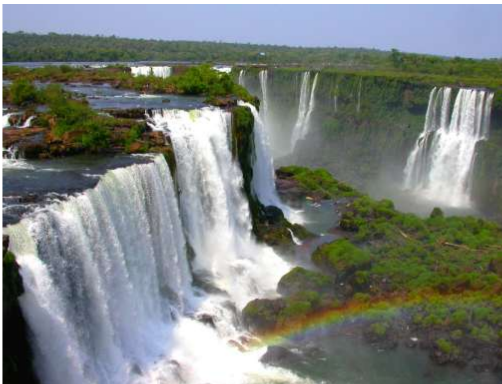
Iguazú Falls

Huge, friendly, and fascinating, Argentina offers the naturalist a wealth of exceptional birding and wildlife spectacles. This exciting new tour focuses on the special birds of the country's scenic northern region. Our carefully planned itinerary takes us to the top birding locations in all six major biomes of this most bird-diverse part of Argentina. Along with many widespread species, we'll also have opportunities to observe many exciting endemics and near-endemics. You certainly can expect a list of over 450 exciting bird species! The recent publication of a superb well illustrated field guide makes a birding visit to this magical country even more appealing.