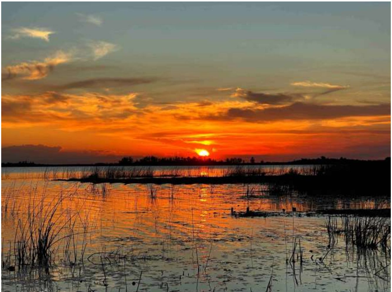
Sunset over the spectacular Ibera marshes

The incredibly rich Iberá wetlands and grasslands are a joy for birders where daily lists can easily be near to 100 species! Here another completely different exciting set of avifauna awaits us. Exploration is by foot, in 4 x 4 and during relaxed boat trips. At the top of the list of prized species is the mega rare Yellow Cardinal and impressive Strange-tailed Tyrant; the black-and-white males of this endemic breeding species sport unbelievably long black tail flags. Other highlights here include; Greater Rhea, Jabiru, Lesser Yellow-headed Vulture, Pinnated and Stripe-backed bitterns, odd Plumbeous Ibis, rare Yellow-breasted Crake, Giant Wood-Rail and striking White and Black-and-White Monjitas, Crested Doradito to rare Saffron-cowled and dazzling Scarlet-headed Blackbirds. Native grasslands are home to a stellar line-up of rare and colorful seedeaters, all in breeding plumage; including the recently described Iberá, plus Marsh, Dark-throated, Chestnut, Rufous-rumped, Tawny-bellied and Pearly-bellied and even the tiny but rare flycatcher the Bearded Tachuri.