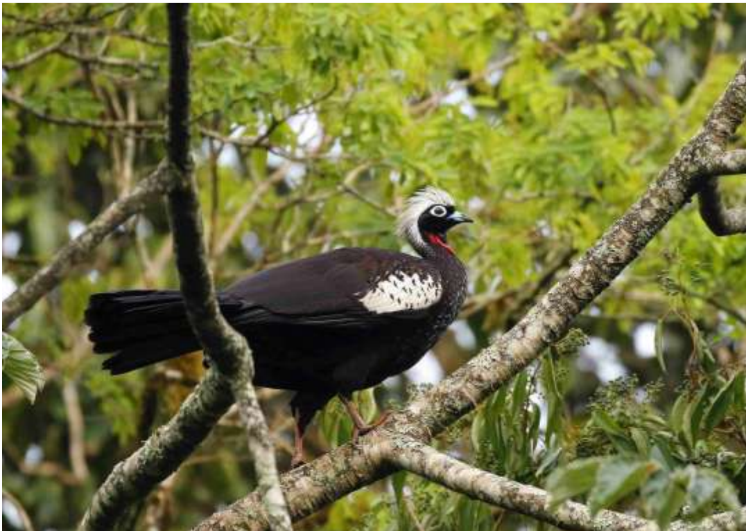
Black-fronted Piping-Guan

The scenic photo opportunities here are incredible, and the sight of these impressive falls will simply take your breath away. But we are in search of more than just incredible waterfalls. Early morning we will explore the lush Paraná Forest reserve for several spectacular birds, including the endangered Black-fronted Piping-Guan,