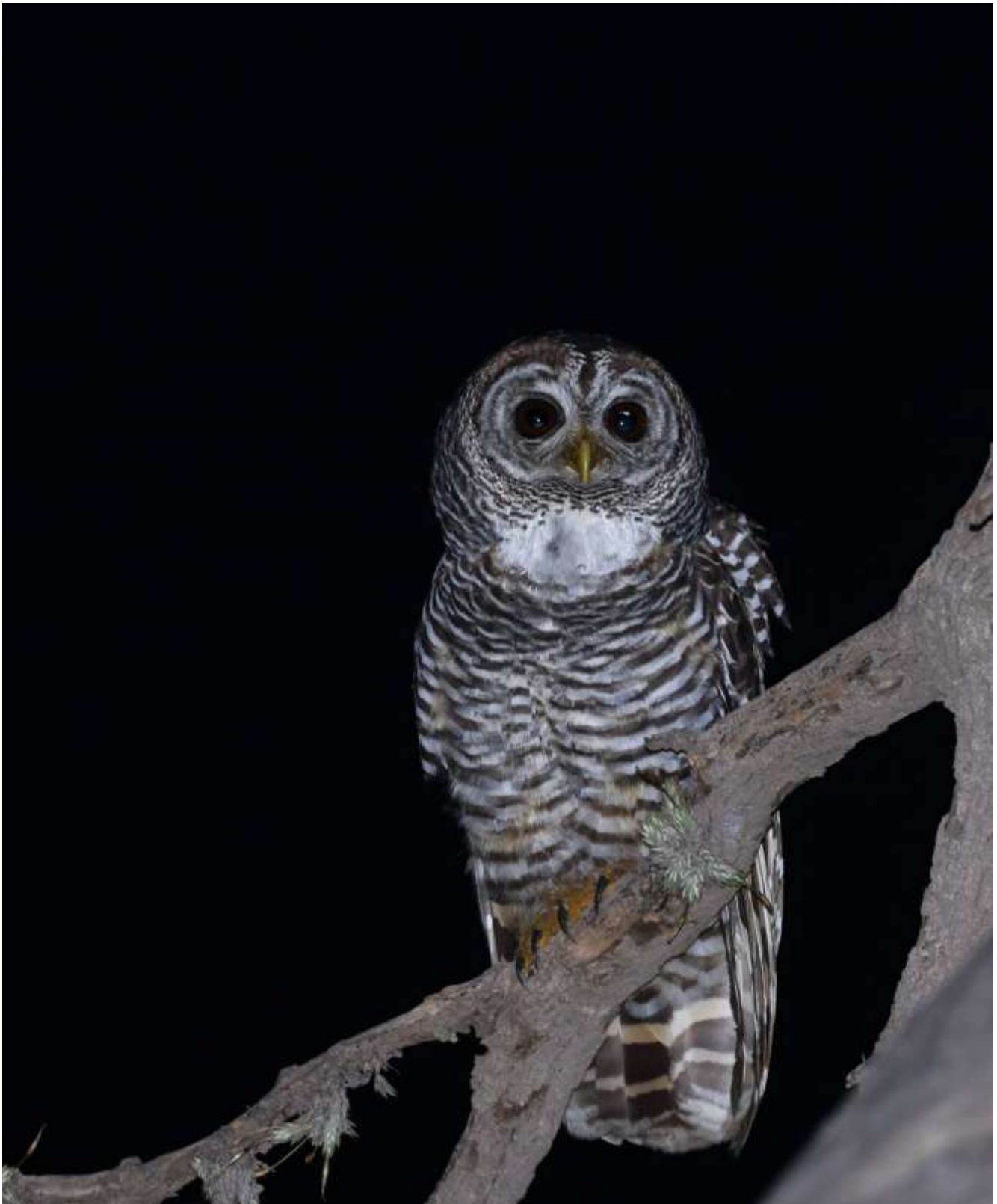
Sought after rare Chaco Owl