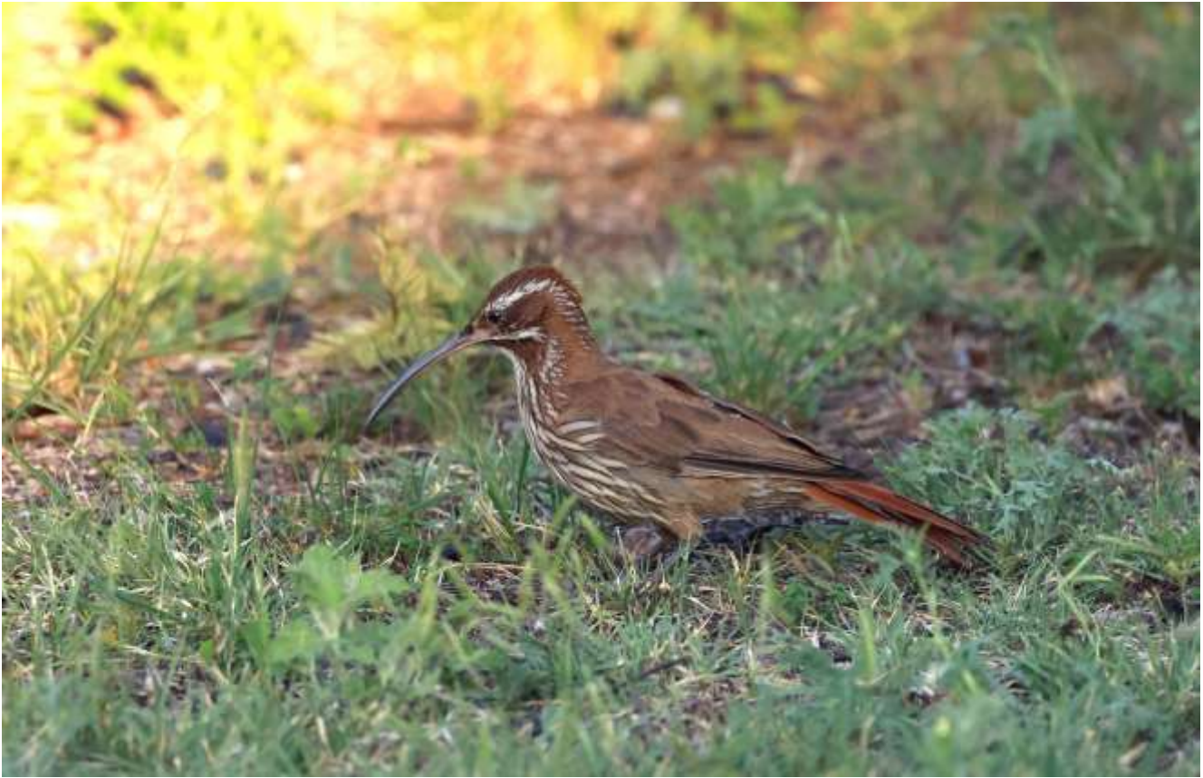
The distinctive Scimitar-billed Woodcreeper

Here we will enjoy a wealth of birds but also concentrate also on low-density near-endemics such as Crested Gallito, the Spot-winged Falconet and the cool-looking Black-bodied Woodpecker, but whatever the results, you can be sure that each day our bird list will be a long one.