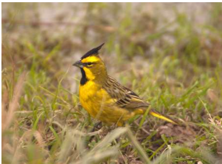
Yellow Cardinal

The reserve is certainly an epicenter of seedeater diversity, and we hope to encounter several colorful species of these grassland gems in attractive breeding plumages: Dark-throated, Rufous-rumped, Tawny-bellied, Chestnut, Marsh, Pearly-bellied, Rusty-collared, and the Iberá Seedeater, described as a species as recently as 2016. For sure one of the trips top birds will be the cool-looking and endangered Yellow Cardinal, the brightly colored males are amazing!