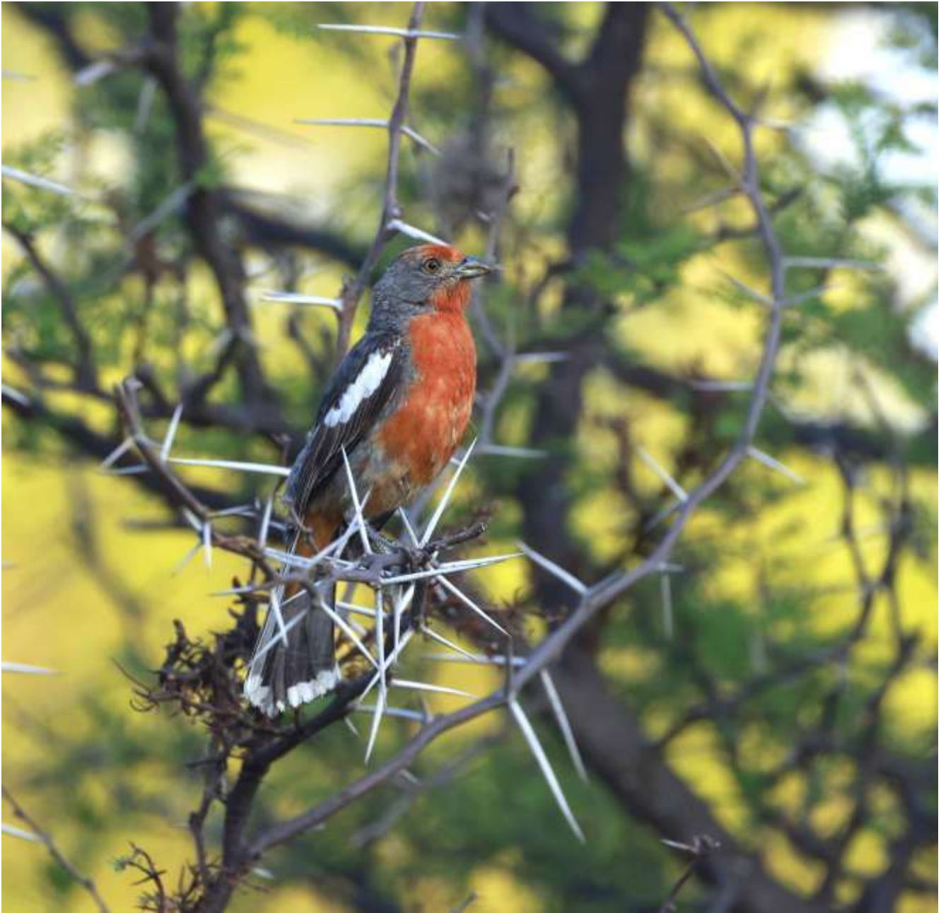
White-tipped Plantcutter