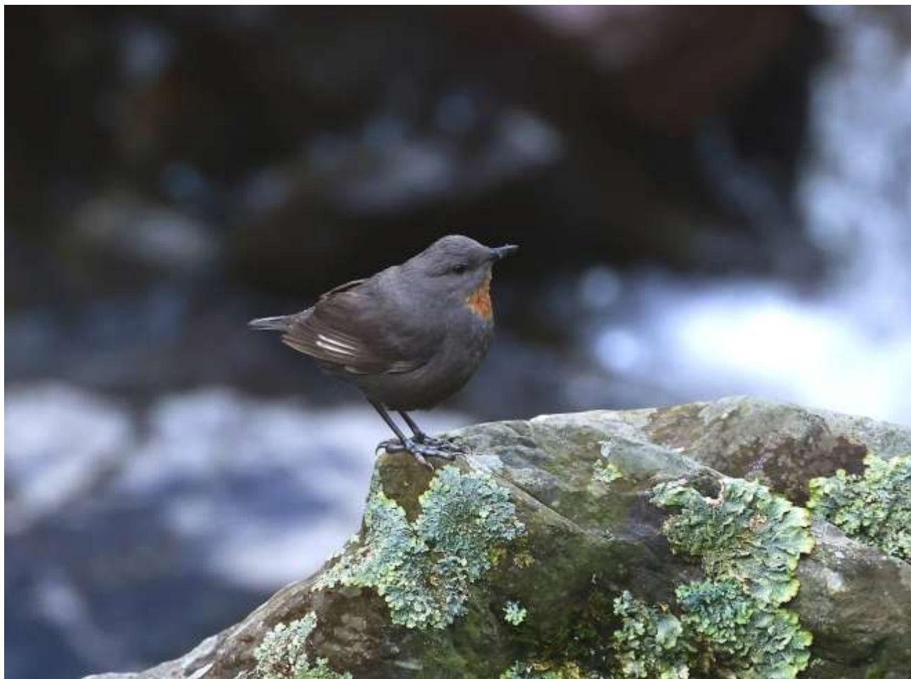
Stunning Rufous-throated Dipper

wonderful Torrent Duck —one of the world's greatest waterfowl—and the near endemic Rufous-throated Dipper !