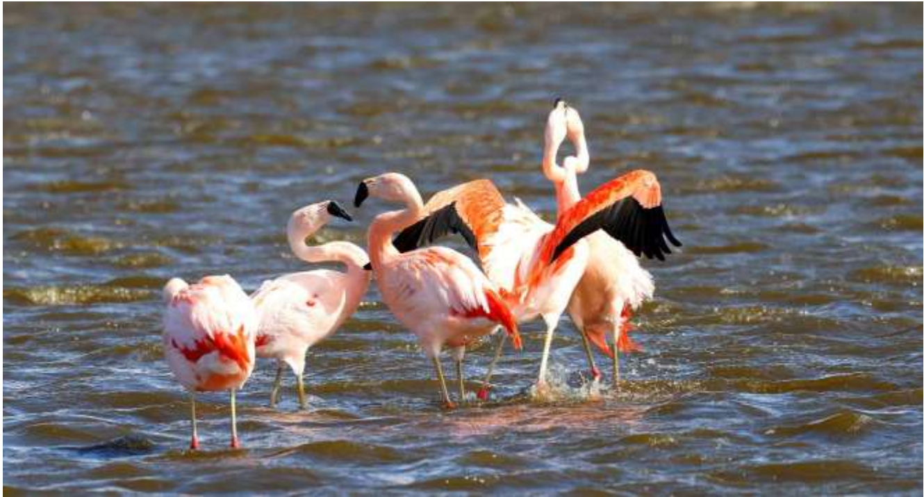
Chilean Flamingo

of between 770-2,300 square miles and is truly a birders paradise. Holding more than half a million migrant shorebirds annually and thousands of all three species of flamingo as well as an incredible number and diversity of waterbirds. These should include Coscoroba Swan and all three species of coot, White-cheeked Pintail and Red Shoveler. Here good numbers of parasitic Black-headed Duck are found; they lay their eggs in the abundant Brown-headed Gull nests! Attractive Silvery and Great Grebe breed along with a few Two-banded Plover and Pantanal Snipe. We will also search the reed beds for the poorly-known Dinnelli's Doradito and the gorgeous but secretive South American Painted Snipe and with luck stand a good chance for the rare Dot-winged Crake.