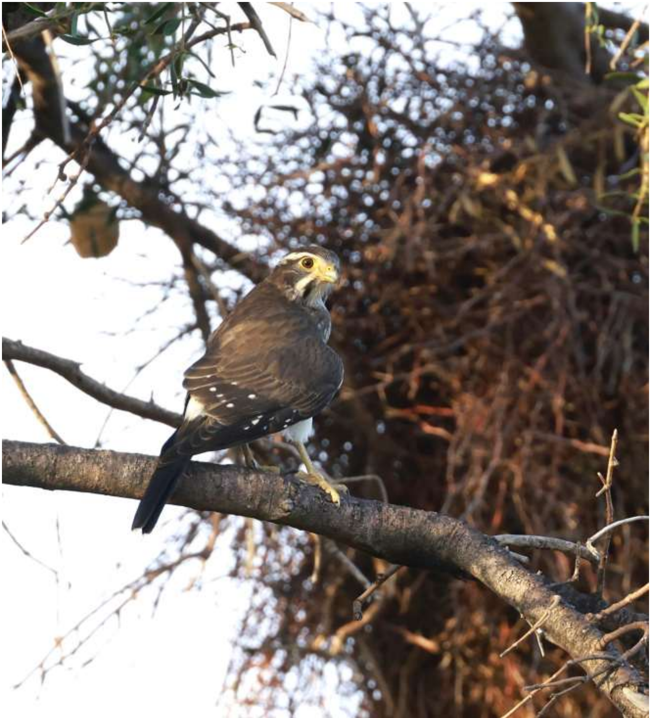
The superb Spot-winged Falconet

As the day begins to warm up, we will begin the fairly long drive to the cooler climate of Tafi del Valle, with a couple of birding stops along the way before we arrive at our hotel in the late afternoon. We begin by driving through the vast salt desert before marvelling at the significant changes in landscape from the flat expanses as we moved through rolling and vibrant green countryside as we climbed up into the wooded foothills of the Andes to the quaint town of Tafi Del Valle. On our arrival at our delightful hotel a lovely rose garden often the lovely song of either an Andean Slaty Thrush or Chiguanco Thrush is serenaded us.