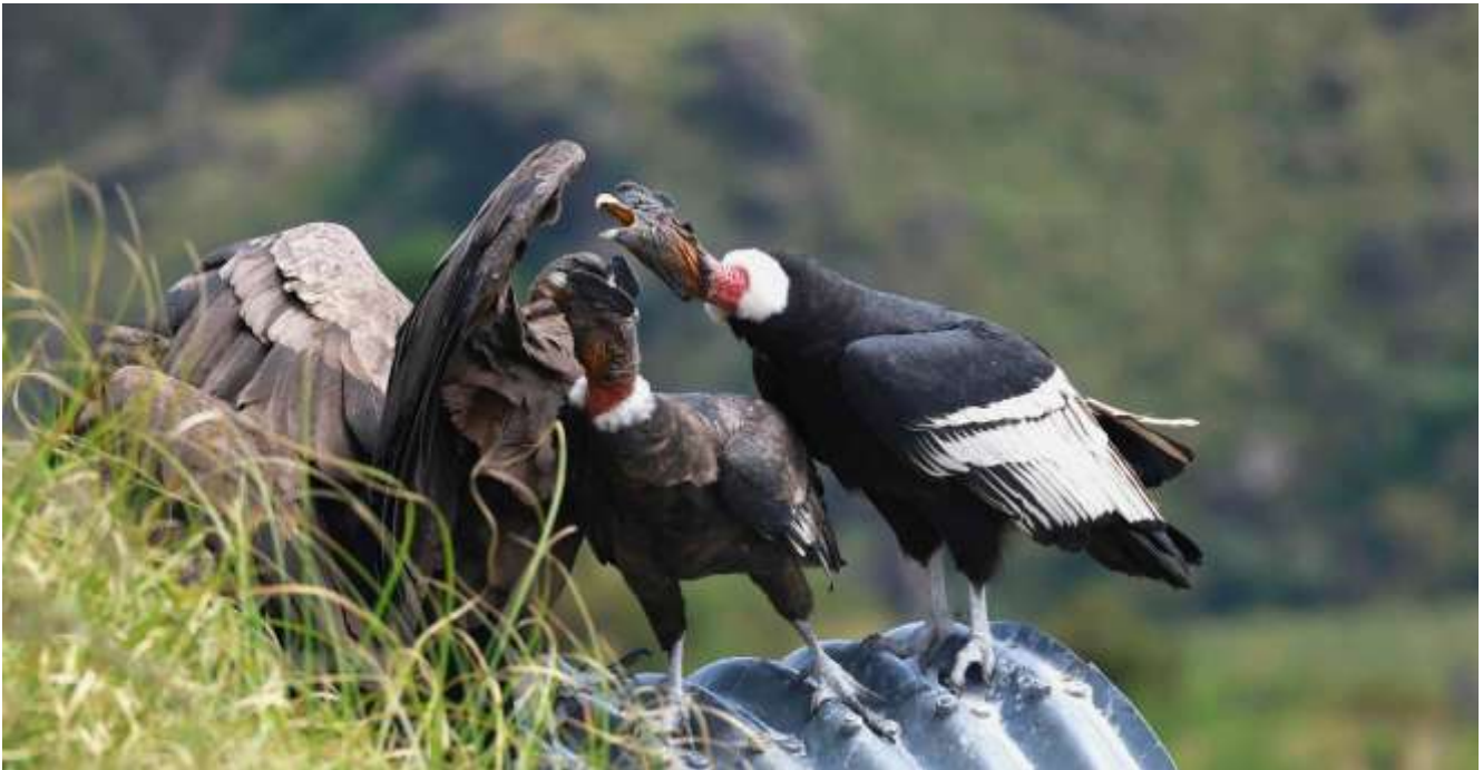
Iconic Andean Condor

January 15, Day 10: Morning direct flight to Córdoba; Birding the East Slope of the Andes. After breakfast, we will make a short drive to the domestic airport for our early morning direct flight to Córdoba, in search of mid-elevation endemics, we will drive up to about 7,000 feet on the Pampa de Achala, a picturesque area with easy birding close to the road and an excellent introduction to the habitats of the eastern slope of the Andes. This area has to be the best anywhere in South America for close encounters with the iconic and huge Andean Condors right off the roadside. Amazingly we have had soaring birds within just a few meters of us looking straight into our eyes! Roosting sites are easy to scope too offering truly incredible studies!