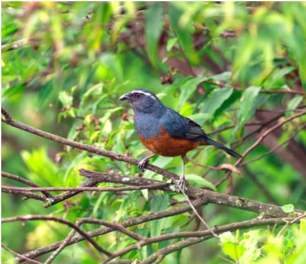
Rufous-bellied Mountain Tanager

Between 6,500 and 9,500 feet, open fields and grasslands alternate with patches of shrubs. These open areas are favored by both Huyaco, Andean and larger Ornate tinamou. Other species we can hope for include Plain-colored and Band-tailed seedeaters, Greenish Yellow-Finch, Black and Hooded siskins, Long-tailed Meadowlark, and Ash-breasted, Gray-hooded, and Plumbeous sierra finches. Other key species may include Rock Earthcreeper, Cream-winged Cinclodes, the Rufous-bellied Mountain Tanager and the near-endemic Tucuman Mountain Finch, both of which are quite local in distribution.