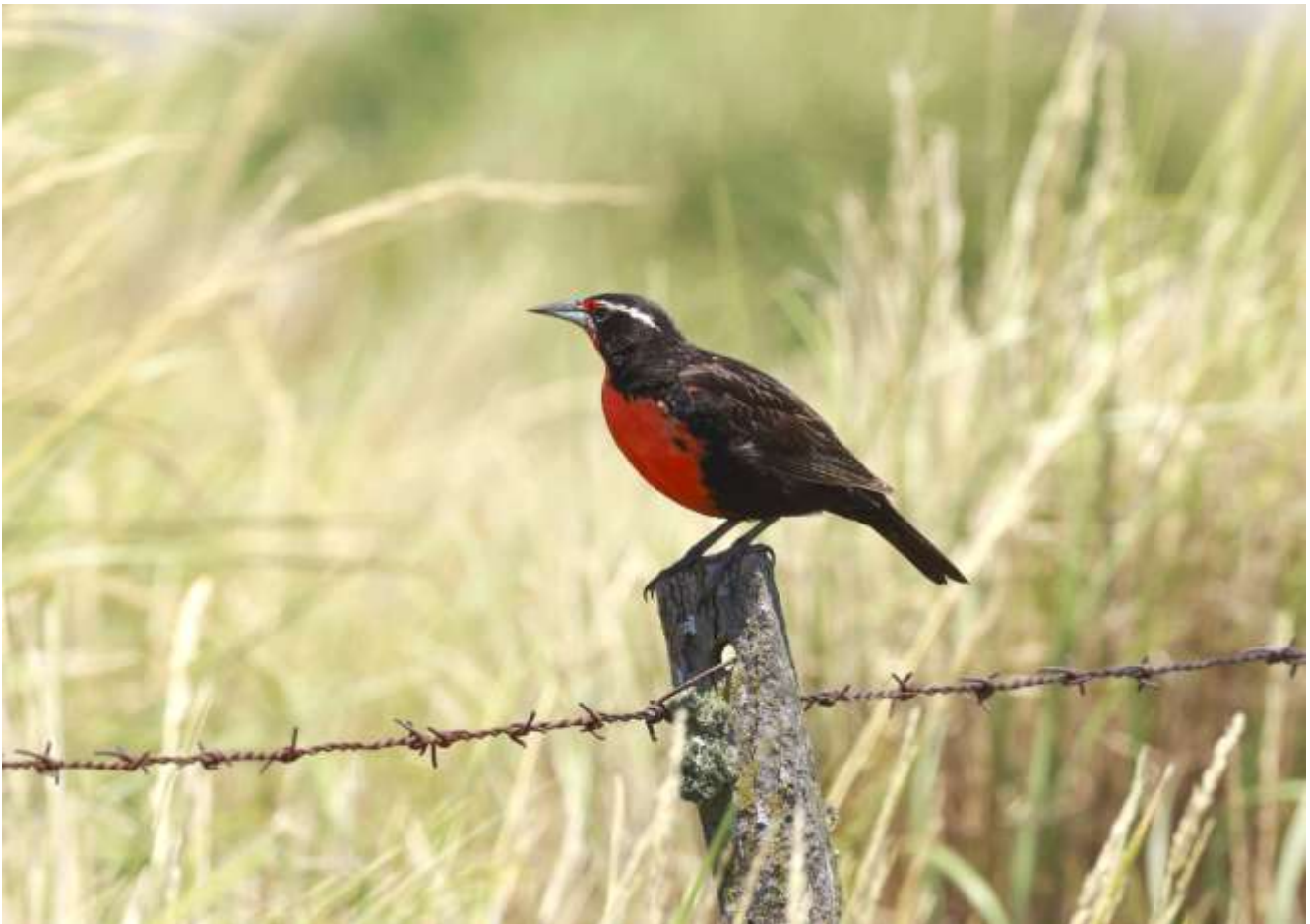
Endemic Sierran Meadowlark (to be split from Long-tailed) adult male

By late afternoon will be descending into the more diverse Chaco habitat, where bird density is higher. Here we will check in to our lovely hotel for two nights, wonderfully situated in pristine Chaco habitat, with all of our wanted birds just outside the door! We may even have time for a cooling dip in the hotel's lovely pool.