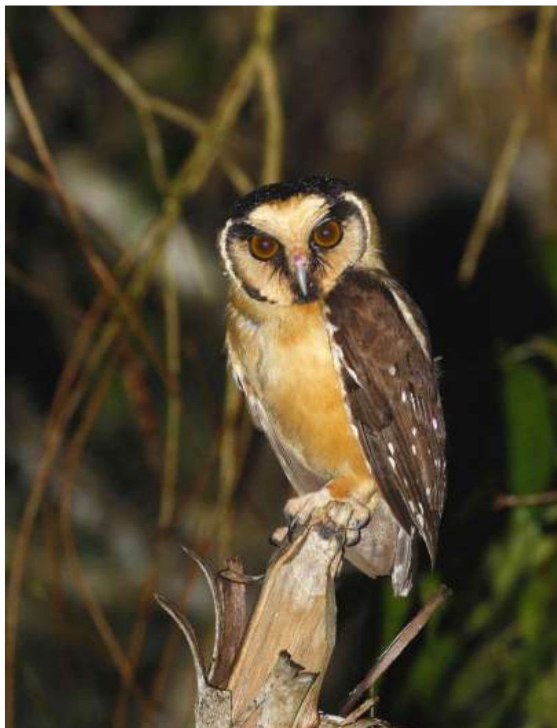
Buff-fronted Owl

January 26, Day 21: Flight onto Buenos Aires. This morning, we transfer to the airport and fly back to Buenos Aires and transfer for our connecting flights homebound. If you would prefer to spend this night in