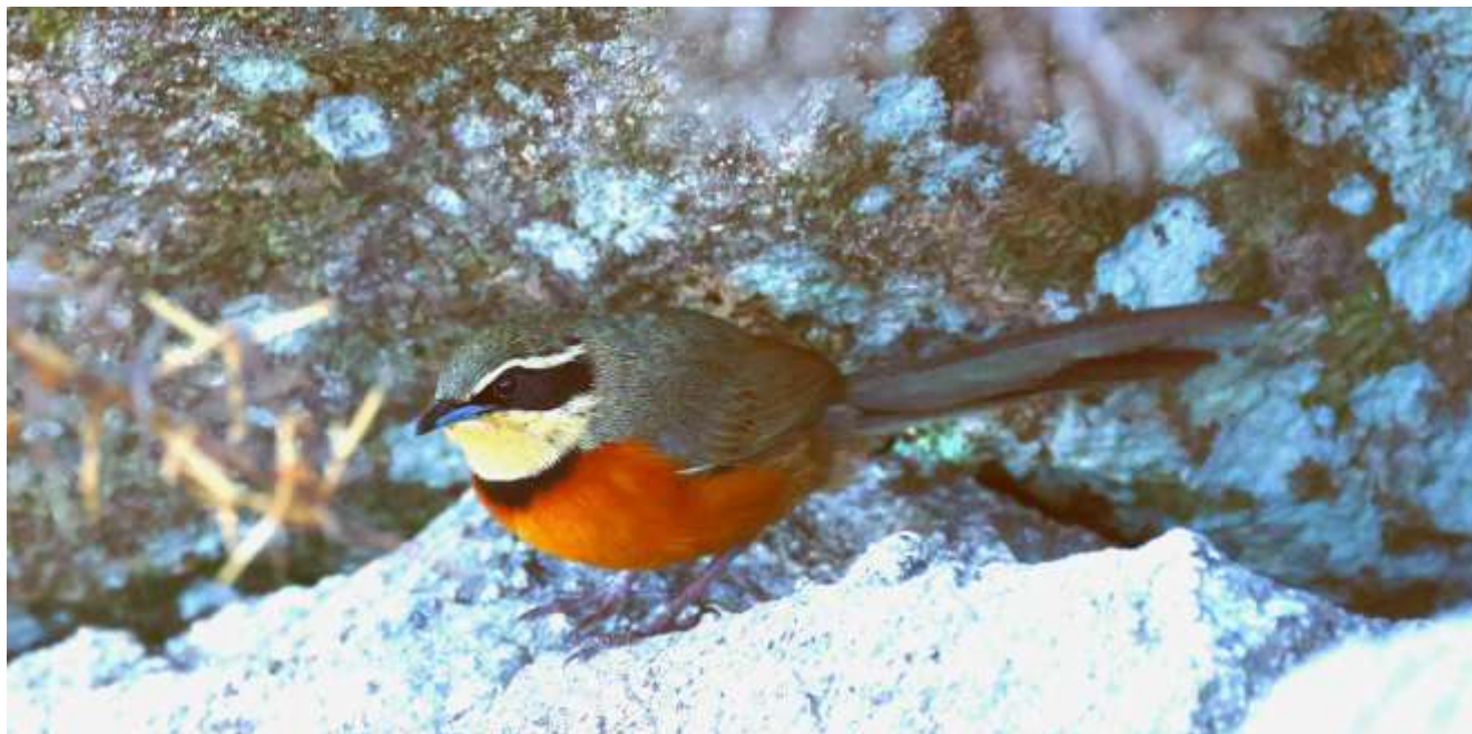
Magical Olive-crowned Crescentchest

The fascinating habitats of northern Argentina include both dry Chaco woodland and the Sierran Chaco, a desert-like region stretching from southeastern Bolivia across western Paraguay and into the heart of northwest Argentina. The Chaco avifauna is particularly rich, and the vast majority of which are not especially well known to birders. Among the highly sought-after species here are the Black-legged Seriema, Brushland Tinamou, Spot-winged Falconet, Black-bodied Woodpecker, Chaco Owl, Ash-colored Cuckoo, Rothschild's Swift, Scimitar-billed Woodcreeper, stunning Blue-tufted Starthroat, a distinct form of the Olive-crowned Crescentchest (an excellent candidate for a future split), Brown Cachalote, Chaco Sparrow, Black-crested Finch, Black-crowned Monjita, Patagonian Mockingbird, White-tipped Plantcutter, Spot-backed (Chaco) Puffbird, Crested Gallito and endemic Sandy Gallito, White-throated Cachalote, Steinbach's Canastero and recently described Monte Yellow Finch. While unique desert salt flats are home to the endemic Salinas Monjita, a large and strikingly beautiful flycatcher. To those familiar with the Sonoran Desert of the American Southwest, much of the Chaco will have a familiar feel. Many of the tree genera are shared, and the sheer abundance of birdlife also recalls the Sonoran Desert: the birds' morning exuberance is such that you literally don't know where to look next! Birding here is very easy, similar to birding the savannas of East Africa.