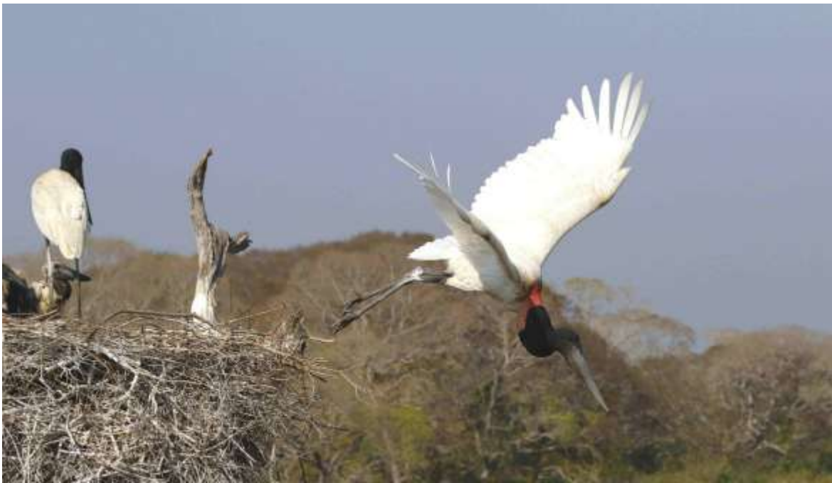
Jabirus at rest

Raptors abound here: Snail Kites will be a common sight along the roadside, while lovely Long-winged Harriers gracefully quarter the marshes. Soon we will spot family groups of huge Greater Rheas or stately Red-legged Seriemas patrolling the fields. Roadside wires are favorite perches for Fork-tailed Flycatcher (abundant), striking white and rarer Black-and-White Monjitas, and colorful Campo Flickers and keeping our eyes peeled for the first colorful rare seedeaters.