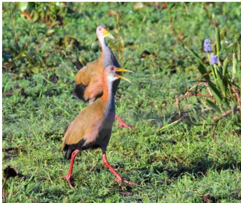
Giant Wood-Rails

The area's flagship bird is a unique songbird of climax grasslands, the well-named Strange-tailed Tyrant. Males in breeding plumage are truly striking, black and white with bare rufous throat skin and huge vertical black tail flags. This will be one of our main targets in the species' stronghold, and hopefully we can also enjoy the males' comical flight displays above the grass, their strange tails used as rudders. They remind your leader of east African grassland species such as the whydahs and widowbirds, which also have wild-looking tails deployed in the male's aerial display. Another couple of tiny flycatchers we hope to encounter are the tiny Bearded Tachuri, in grasslands and Crested Doradito in the rich marsh side vegetation.