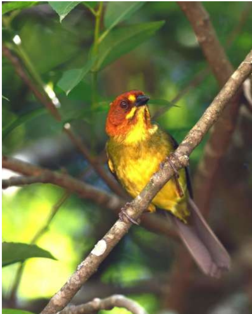
Fulvous-headed Brushfinch

Among the many possible sightings here are the Rufous-thighed Kite (scarce), Solitary Eagle (quite uncommon), the near-endemic Red-faced and Yungas guans, Toco Toucan, Gray-cowled Wood-Rail, Green-cheeked Parakeet, Scaly-headed Parrot and Tucuman Amazon, Mitred Parakeet, Large-tailed (or Yungas) Dove, Golden-olive Woodpecker, Sparkling Violetear, Ochre-cheeked Spinetail, Spot-breasted Thornbird, Slaty Elaenia (abundant!), Ochre-faced Tody-Flycatcher, Mottle-cheeked, White-throated and Buff-banded tyrannulets, Streak-throated Bush-tyrant, Plush-crested Jay, Andean Slaty Thrush, Mountain Wren, Pale-legged Warbler, Brown-capped Redstart, Sayaca and Orange-headed tanagers, Moss-backed Sparrow, near endemic Rusty-browed and Rufous-sided warbling finches, Common Chlorospingus, Golden-winged Cacique, Black-backed Grosbeak, Purple-throated Euphonia and White-browed and Fulvous-headed brushfinches.